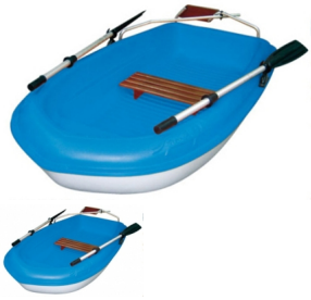
BIC Sportyak 213 Dinghy Boat