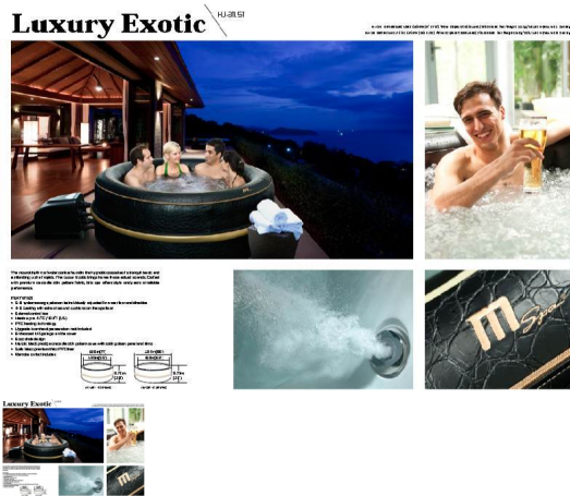
Inflatable Spa - EXOTIC

Rating: Not Rated Yet Ask a question about this product