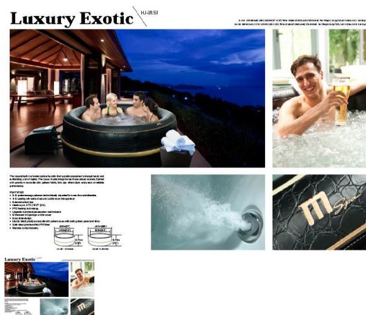
Inflatable Spa - EXOTIC

Rating: Not Rated Yet Ask a question about this product